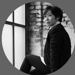
Xian Zhang Conductor